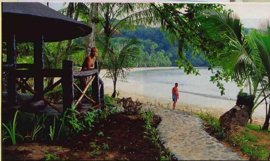
Bom Bom's attractive airconditioned chalets lie on a limpid, palm-fringed bay, overlooking an untapped ocean teeming with catches of which dreams are made.

a base for airlifts into that short-lived country.